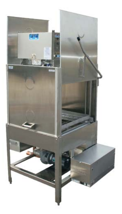
Requires Deep Tables